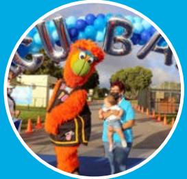
Miami HEAT mascot, Burnie