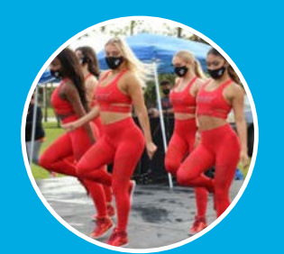
Miami HEAT dancers